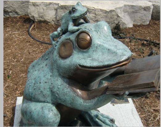
THE FROG PRINCE