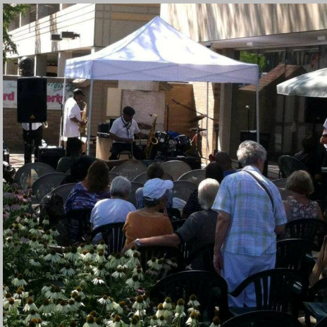
Aug 23, 2013: The Thomas Brothers Band